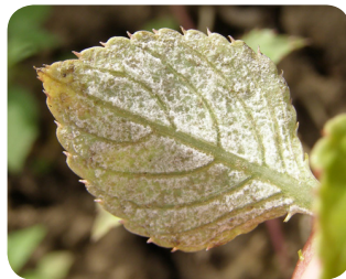
2. Underside of infected leaf