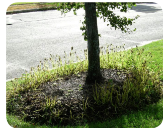
3. Advanced Infection by Downy Mildew

Because the early and mid part of 2012 were overly hot and dry; the disease did not develop fully until August. Therefore, our area was very fortunate to not have wide spread devastation from Downy Mildew. Unfortunately, once plants are infected there is no cure. Currently, there are fungicides on the market that can slow the progression of the disease, however it is only a temporary solution. If plants are infected, the most important step is to completely remove and dispose of the entire plant. Be diligent in removing all the leaves, flower petals, and roots of the diseased plants.