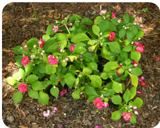
1. Early Infection by Downy Mildew

Early visual symptoms of Downy Mildew resemble a nutrient deficiency or spider mite damage with yellow, chlorotic leaves. Infected plants will have a white powder on the undersides of their leaves. This disease spreads rapidly and will eventually kill an entire planting bed of gorgeous annuals.